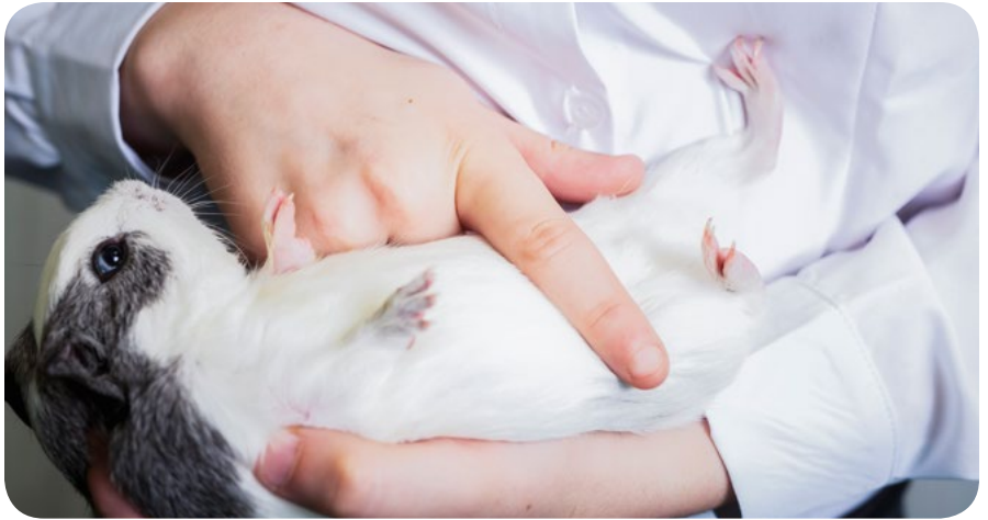
Examining the Cavy: Step 13.

Check your cavy's belly area for foreign hairs by looking at it while you run your fingers up and down over the cavy's belly hair.