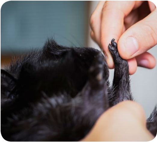
Examining the Cavy: Step 10.