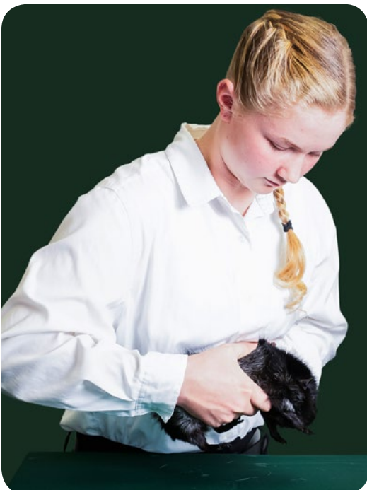
Posing the Cavy: Step 2

Slowly place the animal sideways on the carpet piece on the table. Then pick the cavy up and turn it, without dragging its toenails, so the cavy will be facing the judge. Now both you and the cavy face the judge.